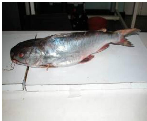
Plate 1a: Marine catfish

Fish and fish products are readily available sources of animal protein in the coastal region of Kenya. The Tana River area is known for freshwater catfish ( Clarias gariepinus ) landings which are smoked by artisanal fishermen to prevent spoilage [1]. Rarely is marine fish smoked in Kenya except cold smoking of sailfish for up-market hotels. In the West African countries on the contrary, marine fish smoking is common [2]. Attempts to smoke marine fish with community participation have been carried out by [3]. Some of the species that have been smoked on trial basis include the popular fish species like Caranx , Siganids , Pomadysis and Barracudas , Lethrinidae , Lutjanidae among others with good response from the communities who have shown great preference in taste and acceptability [3]. Introduction of newer fish candidates for smoking in Kenya like the marine catfish ( Galeichthys feliceps ) provides a chance of enhancing protein in human diet. The marine catfish closely resembles the freshwater catfish ( C. gariepinus ) in appearance (Plate 1a and 1b). It is landed in the north coast and at times finds its way near freshwater catfish landing areas.