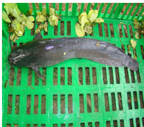
Plate 1b: Freshwater catfish

The marine catfish is however treated as a low value fish by prawn trawlers in Kipini and Ungwana bay areas, discarded by locals or dried and sold at throw away prices [4]. Smoking improves flavor and appearance of fish [5,6]. Marine catfish currently