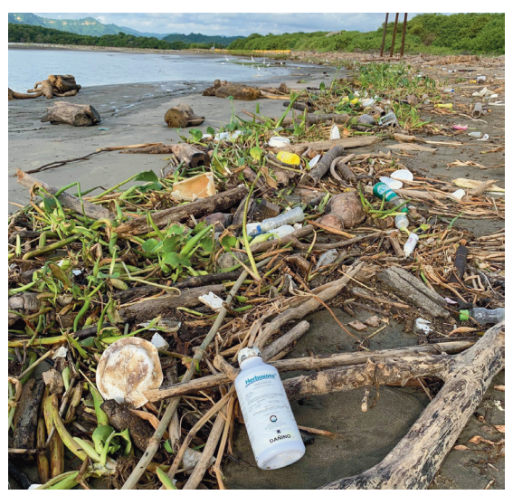
The herbicide bottle found under the washed up plastic waste in a coastal wetland illuminates the manifold threats to the sensitive ecosystems along the coast.

and fragile ecosystems by conducting research and conservation activities. By creating alliances with the public and private sectors to work together on awareness campaigns, the project includes media campaigns, the organisation of special festivals and the painting of murals dedicated to coastal birds and coastal wetlands. The aim is to raise awareness, increase appreciation of these ecosystems and inspire pride in coastal wetlands and their birdlife among the local population in order to gain support for the Eten wet-