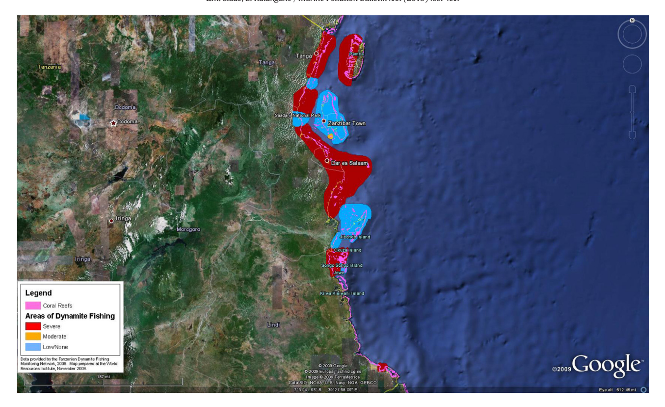
Fig. 1. Map showing incidence of dynamite fishing in Tanzania, 2009.

final market destination for fish caught in this manner. Village fishers also engage in the practice at a local level on their own, both on foot at low tide, and using local boats. Explosive devices no longer rely on traditional sticks of dynamite; home-made bombs are easily created using plastic bottles, granular fertilizer, petrol, detonator caps and small amounts of explosive gel (Fig. 3). One 'bomb' might cost less than Tsh. 15,000 ($8). Fishers are well aware of the detrimental effects of blast fishing on the environment — they complain that blast fishing is affecting their livelihood. They recognise that dynamite has resurfaced with great vigour in the last five years and report that it is normal to hear from 20 to 50 blasts a day in the major affected areas. Local fishers use dynamite due to the pressures of poverty and the