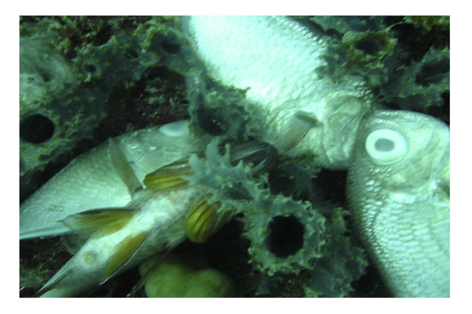
Fig. 5. Picture of dead reef fish as a result of blast fishing.

Key enabling factors for the current continued operation of fishing using explosives along the majority of the Tanzanian coast include: