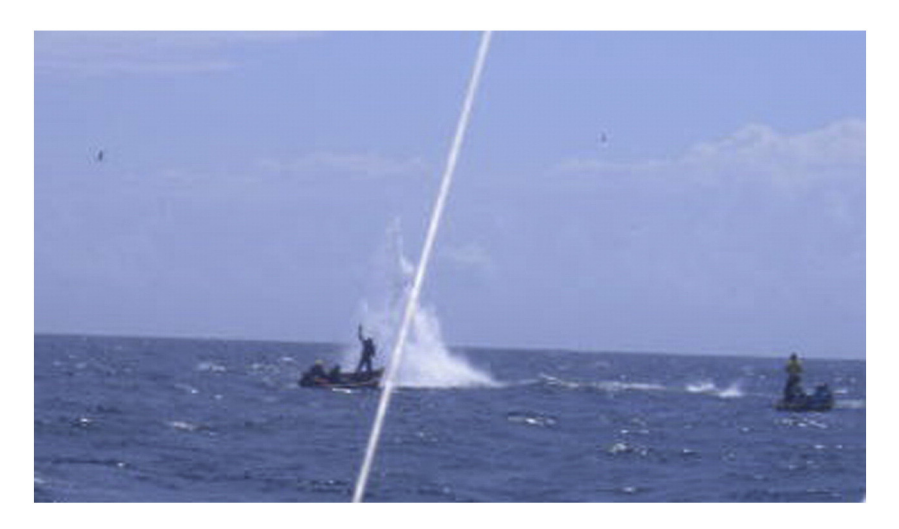
Fig. 2. Blast fishing off of the Dar es Salaam coast.

(You ask) "why haven't people changed their ways — they feel the natural resources are not theirs. People don't cut down their own cashew trees to get cashew nuts. We need to convince people that